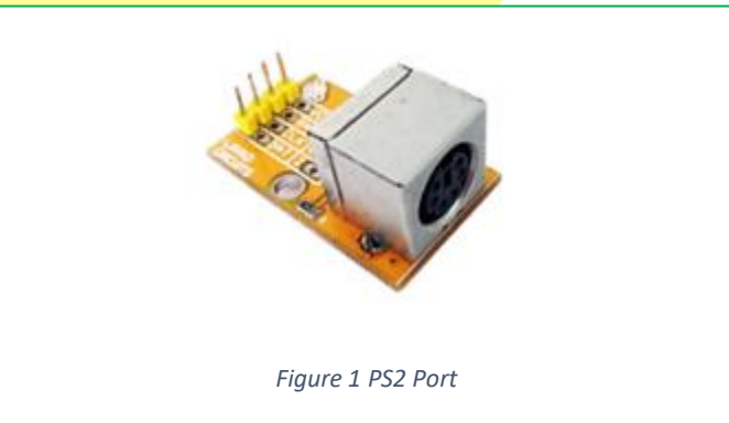
Figure 1 PS2 Port

The PS/2 Keyboard Interface module allows the user to connect a PS/2 keyboard (or mouse) to an Arduino or other microcontrollers. The module facilitates connection by integrating a PS/2 port with standard header pins for power and data lines. The PS/2 port is a 6-pin mini-DIN connector. When connected to a keyboard, alphanumeric characters may then be read by the host microcontroller.